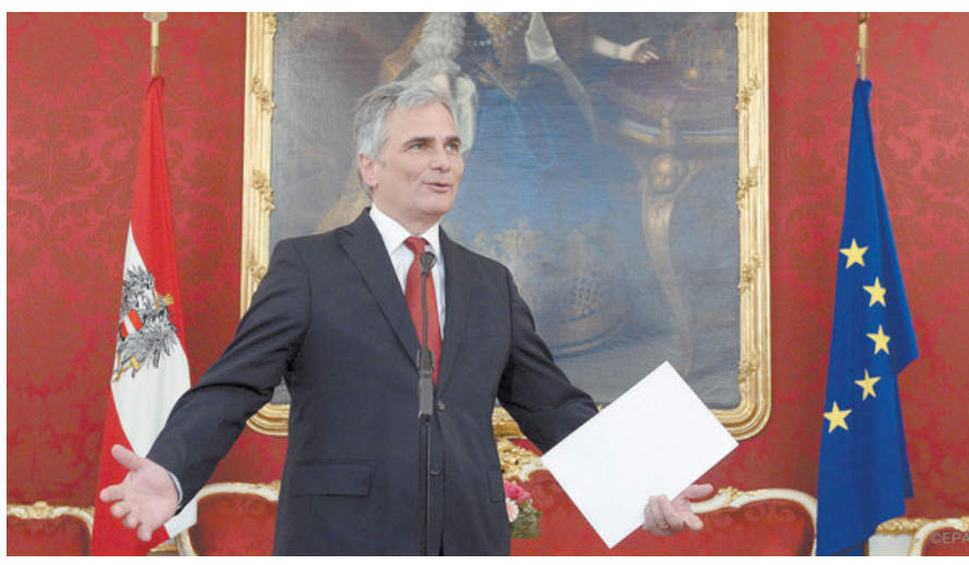
Back in power: Werner Faymann, Austria's chancellor and leader of the Social Democrats, following the election result

Election years are not traditionally a time when governments show their reformist zeal and the past 12 months in Austria have been no exception.